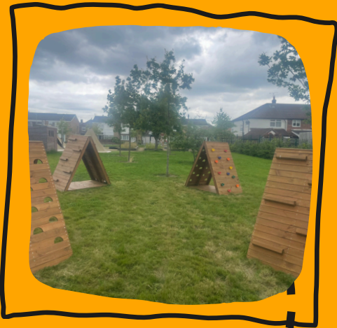
CLIMBING WALLS & SOCIAL SPACES