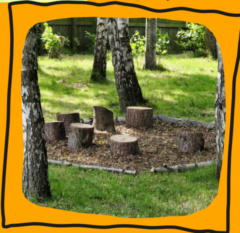
SEATING AREA SOCIAL SPACE