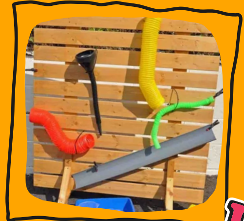
MOBILE WATER WALLS